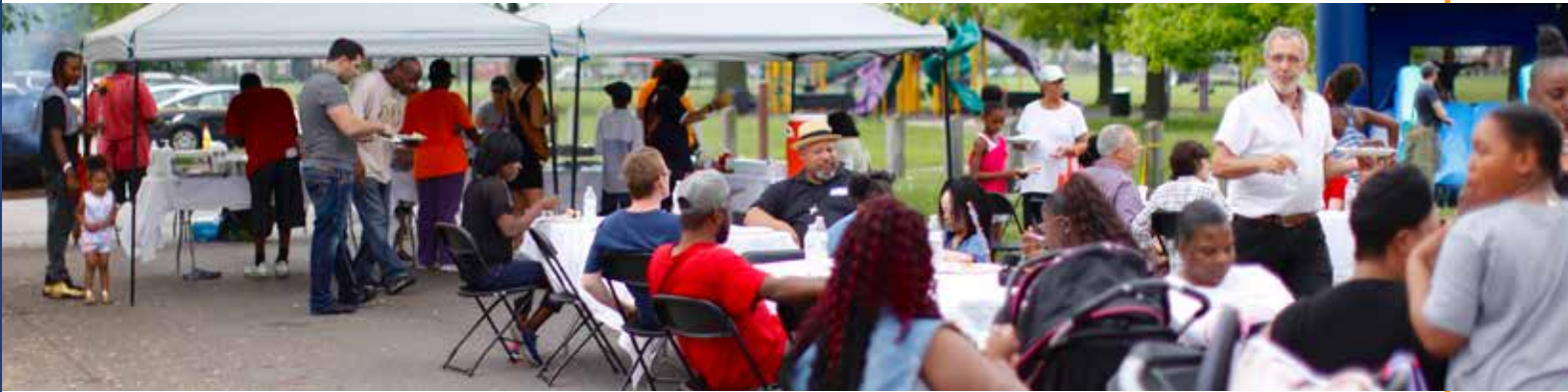
Osborn summertime community event